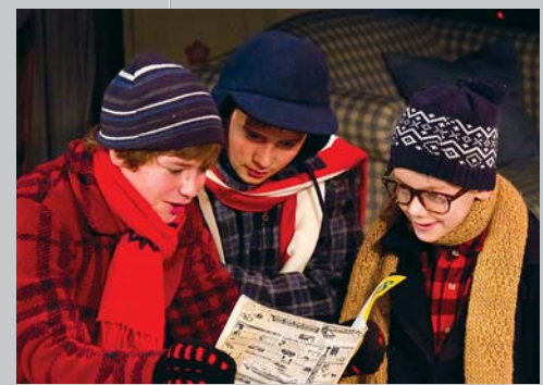
A CHRISTMAS STORY / 2011